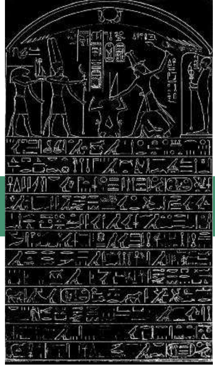
The Stela of Amenhotep III along the road between Aswan and Philae. Graphic adapted from Lepsius, Denkmäler iii, vol. v (1897), pl. 81g

fact that the stela mentions the rebel leader by his name is unusual and is an indication that this person was a formidable foe. The phrase "...His Majesty led unto victory" is an indication that the campaign was led by Amenhotep III personally.